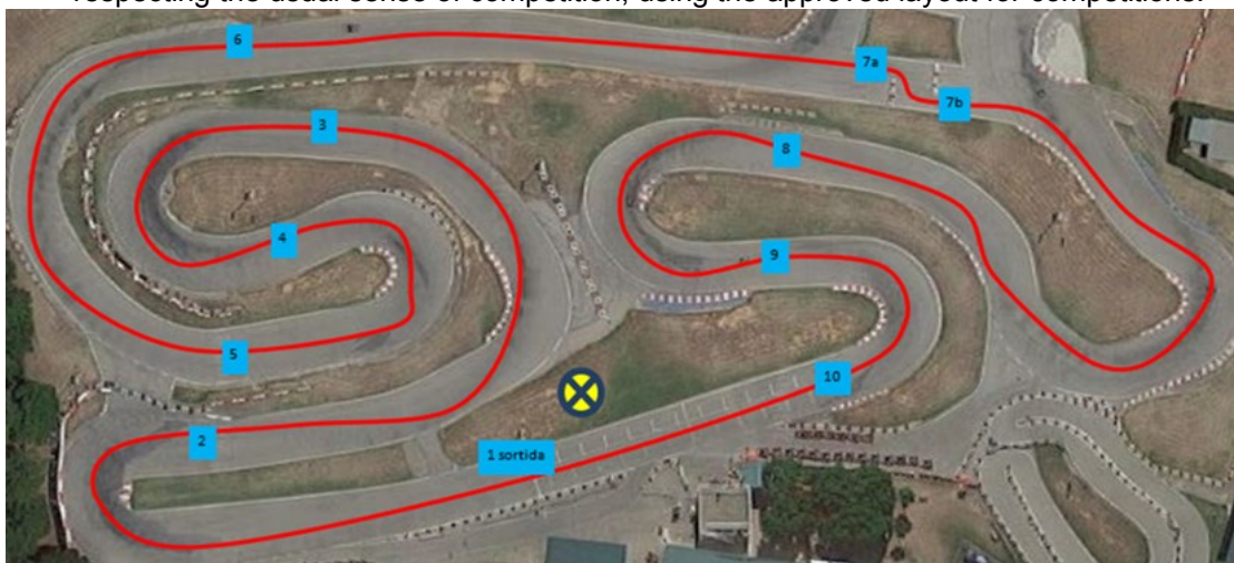
Figure 1. Detail of the different sectors of the Sallent Karting Circuit. The study was conducted respecting the usual sense of competition, using the approved layout for competitions.

Note. Sector 1-2: Main exit straight with a sharp right curve after braking at the end of the straight; Sector 2-3: Long and open left curve; Sector 3-4: Sharp left curve; Sector 4-5: Sharp right curve; Sector 5-6: Open right curve; Sector 6-7: Second long straight of the circuit; Sector 7a-7b: Chicane (fast turns after the straight); Sector 7b-8: Double curve to the right until a slight curve to the left; Sector 8-9: Sharp curve to the left; Sector 9-10: Sharp curve to the right to link with sector 1; Goal: Straight-Detail of the location of the EMG records set and coordination of the karting circuit. Figure 4 shows the circuit and its different sectors.