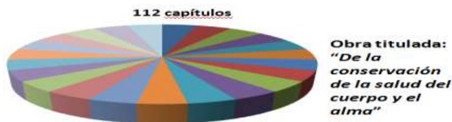
Work entitled "On the Preservation of the Health of Body and Soul" 112 Chapters

Of the one hundred and twelve chapters composing the treatise, thirty-five specifically use the term health and a further two the term healthy. Nevertheless, the remaining chapters are also directly related to health. It should be noted that in numerous instances the specific word “health” does not appear because of a need to provide continuity with the previous chapter, whilst in others the word health is replaced by a pronoun.