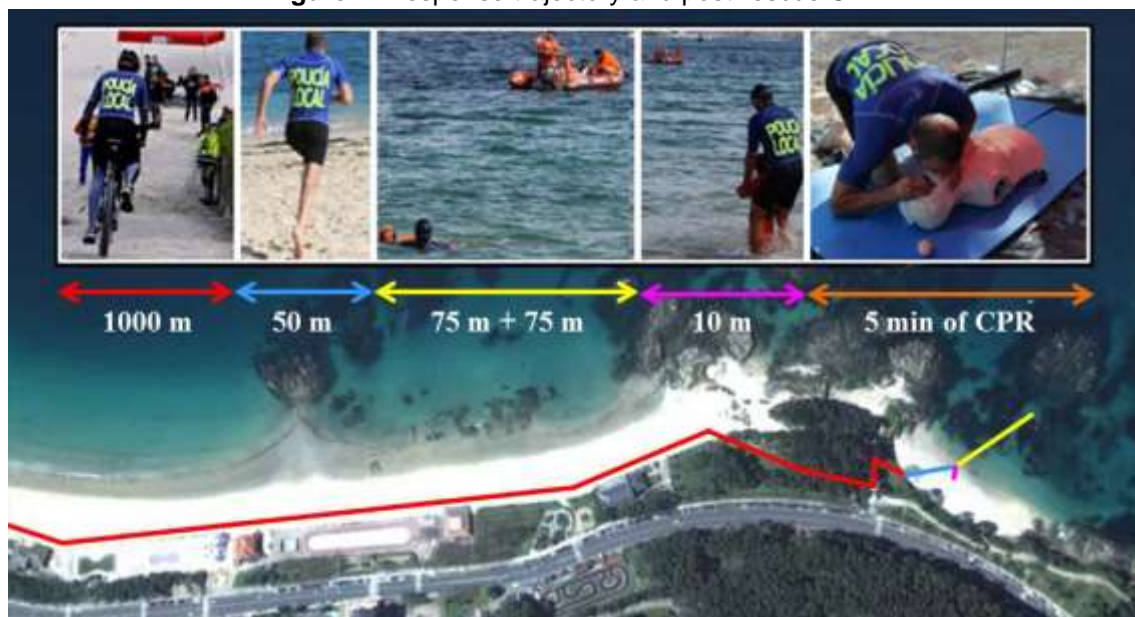
Figure 2. Response trajectory and post-rescue CPR

The rescue test was conducted in the Samil Beach - Spain (Latitude: 42°13'13"N, Longitude: 8°46'33"W). The bike ride was along the promenade. As for the water phase, all participants performed the test on the same date, in the middle of the day, under similar conditions: calm sea (value 0 on Douglas Scale), the average ambient temperature of 21° C, the average water temperature 13° C and wind speed not exceeding 4 m • sec-1 (Figure 2). A rescue dummy approved by the International Lifesaving Federation was used as simulated victim.